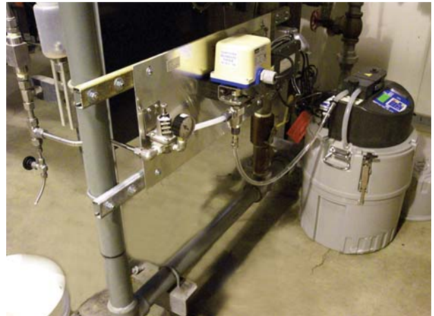
Photo shows purge line lower than desired. Optimum purging occurs when sampler outlet is higher than connection to valve.

The system components come mounted on an aluminum backing plate that also serves as a mounting bracket.