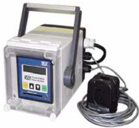
4501 Pump Station Monitor