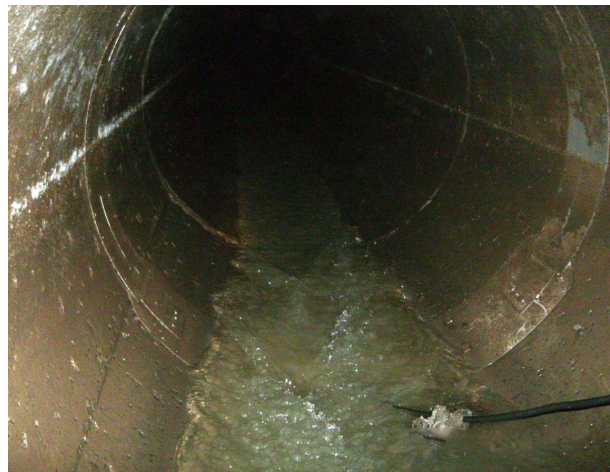
View of flow inside the pipe

This site, in a sanitary sewer, had two options for flow monitoring applications. The first application was in front of an overflow bypass gate where standard area velocity flow monitoring technologies were installed and working, but only intermittently. When the gate closed, the water surcharged the pipe until it overflowed into the bypass weir. The AV sensor was no longer able to read the bypass flow because the water at the bottom of the channel was no longer flowing. Another challenge was with the pipe joints creating turbulence.