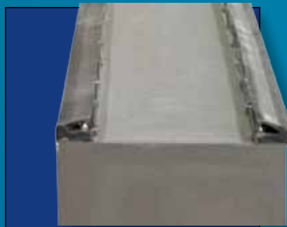
CLOSE UP OF NEOPRENE SEALS